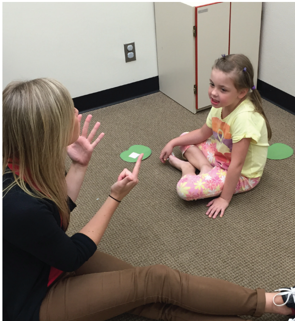
Our graduate students are tomorrow's future Speech-Language Pathologists.

All therapy is based on the client's needs after an evaluation has been performed. The clinic serves many adults and children with various speech, language and hearing difficulties.