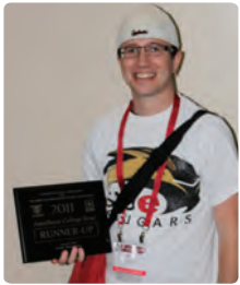
American Association of Nurse Anesthetists 78 th Annual Meeting, Boston National College Bowl sponsored by U.S. Army CRNA student

The SIUE CRNA program continues to encourage national involvement from its students, and again, our students have exceeded our expectations. In 2011, we had various students attend three national meetings: Assembly of School Faculty, Orlando, Fla; Mid-Year Assembly, Washington, D.C.; American Association of Nurse Anesthetists 78 th Annual Meeting, Boston. We are proud of our CRNA students for understanding and relishing in the fact that they are a part of a national professional group.