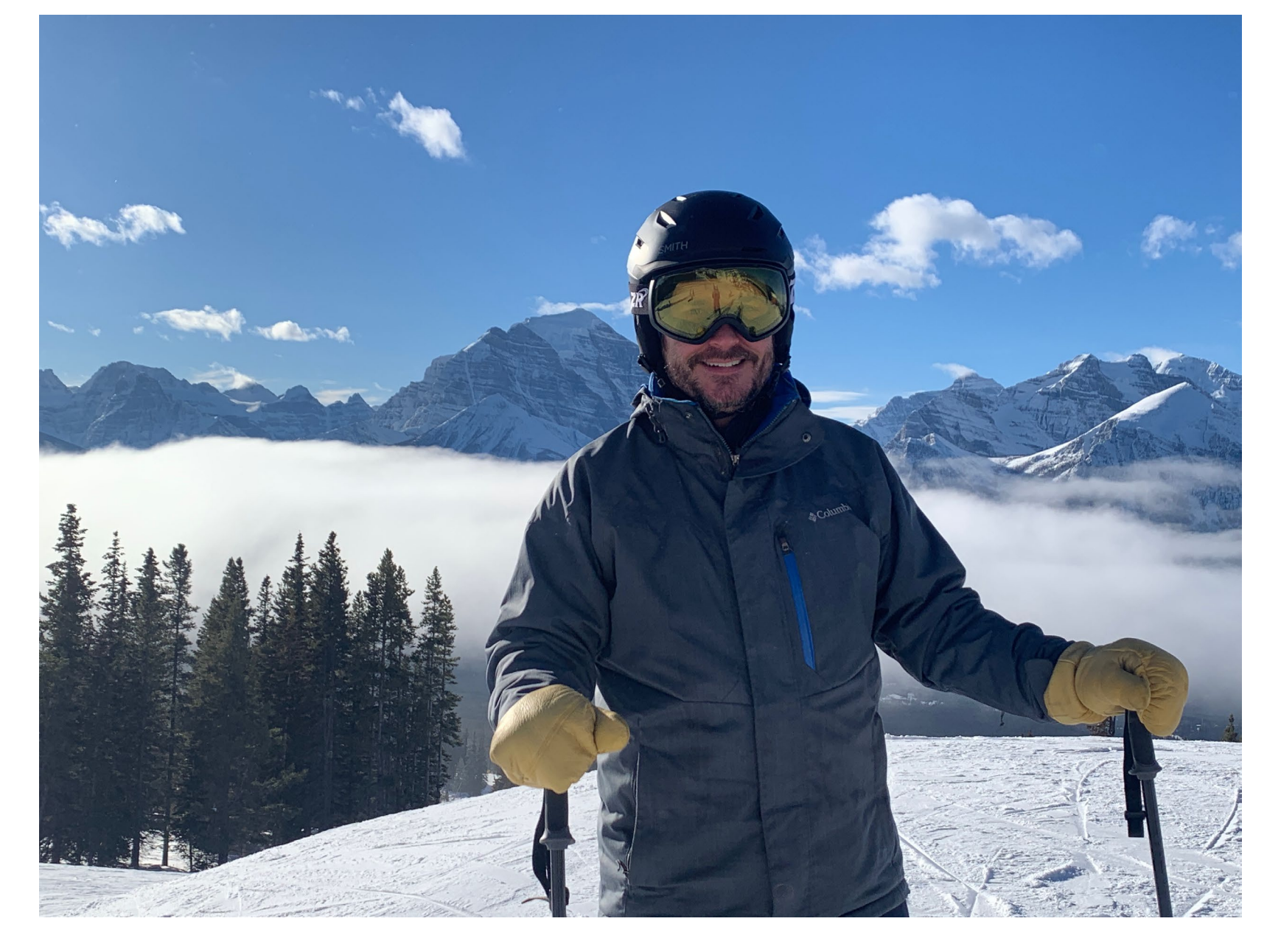
Skiing in the Canadian Rockies. I swear it wasn't all play time!