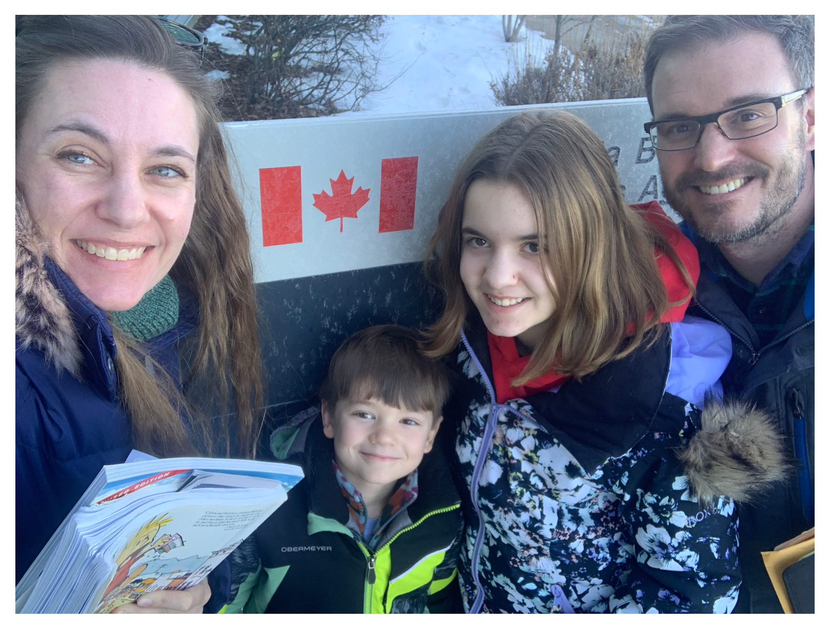
Arriving in Canada (driving from Montana to Alberta)