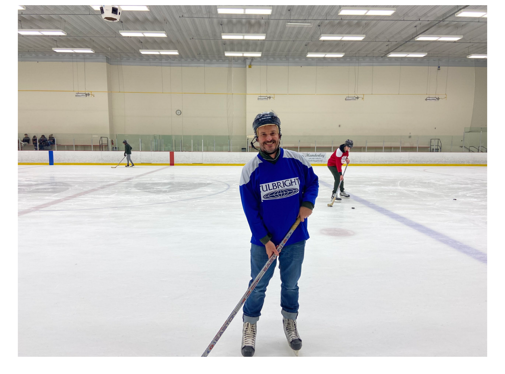
Fulbright Canada's annual orientation hockey game in Ottawa