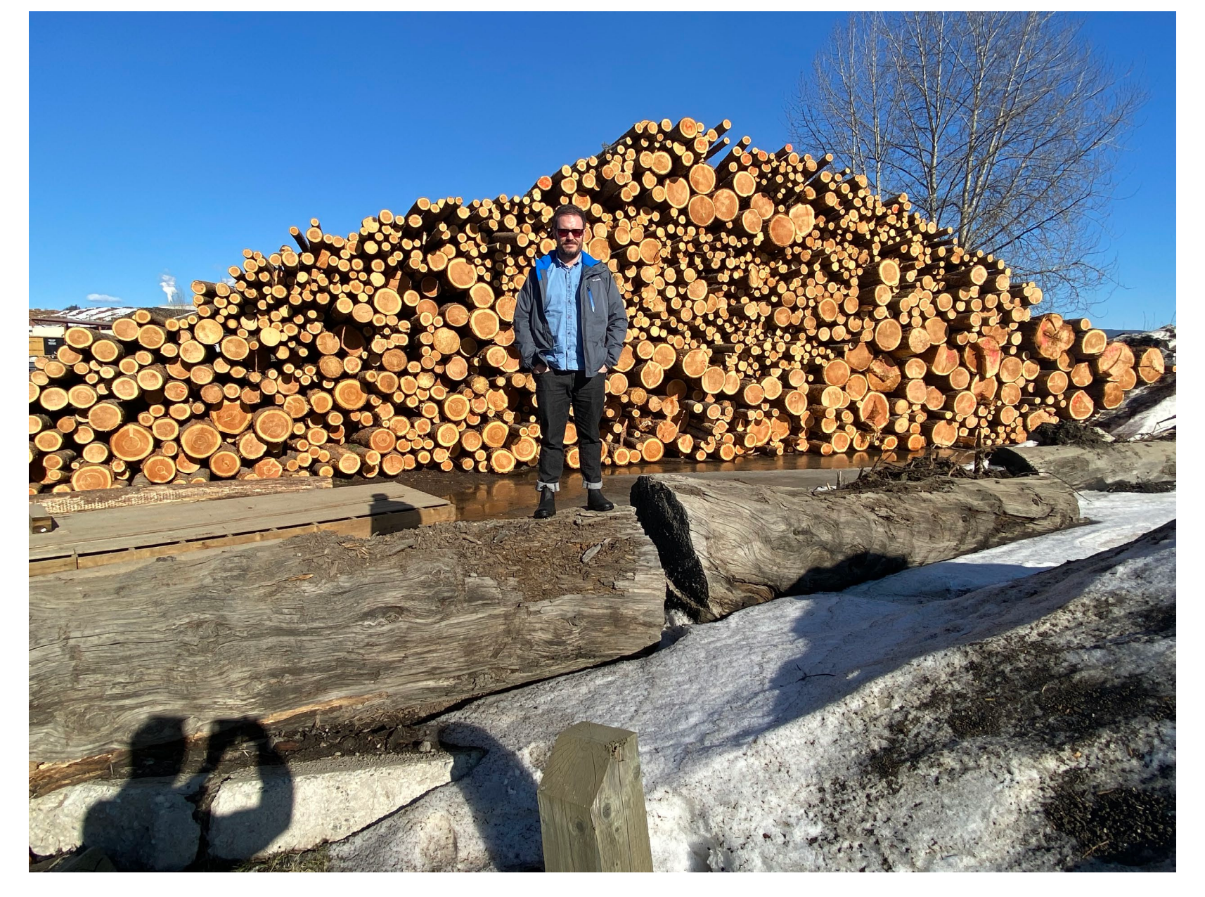
The historian of natural resource industries in the field in northern British Columbia