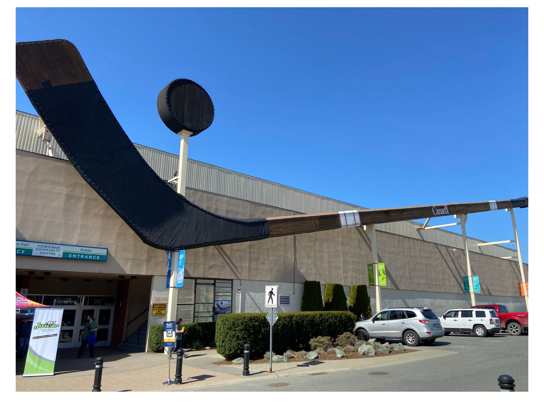
The world's largest hockey stick (for now) in Duncan, British Columbia