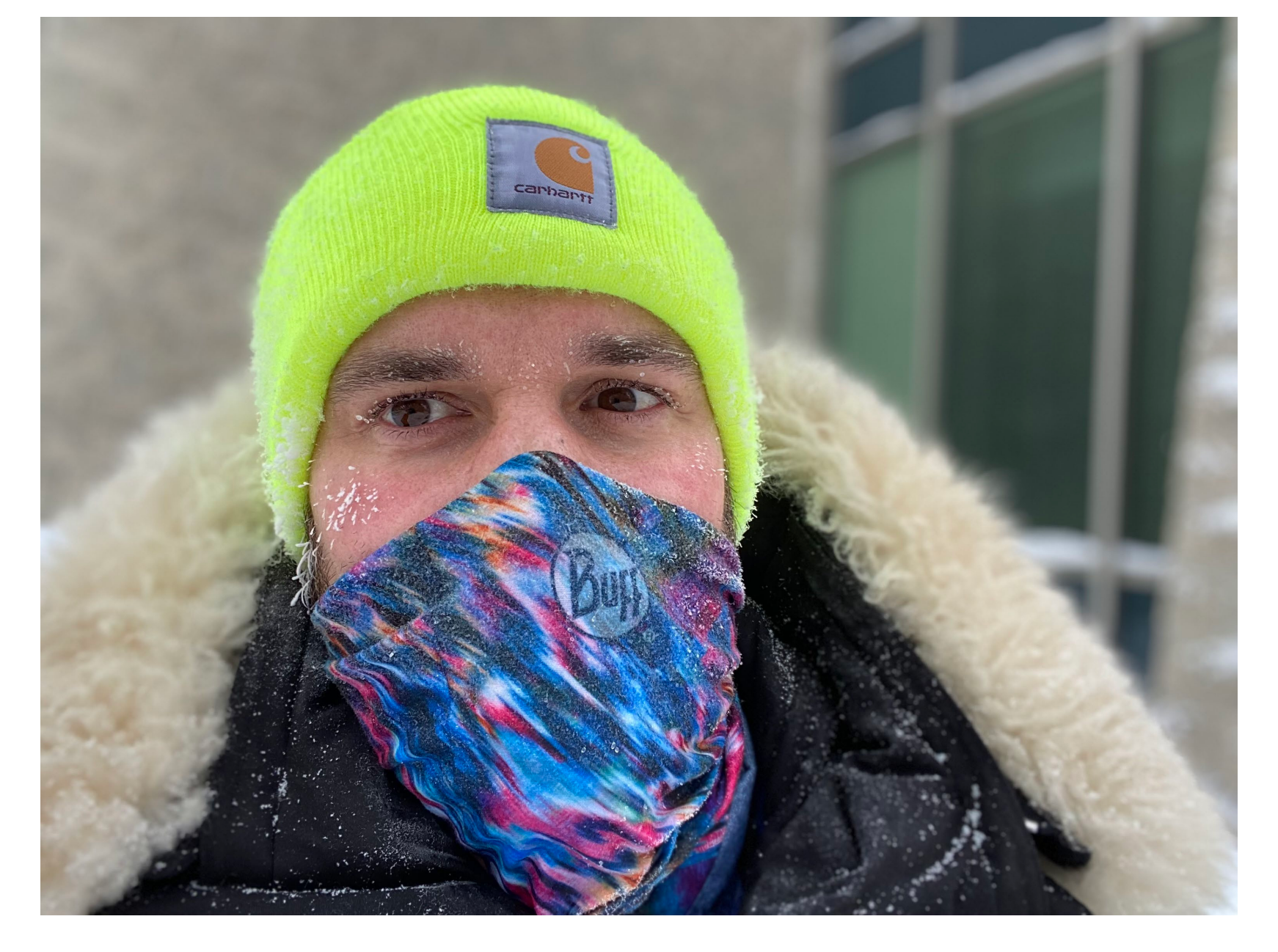
A typical January commute to work in Alberta.