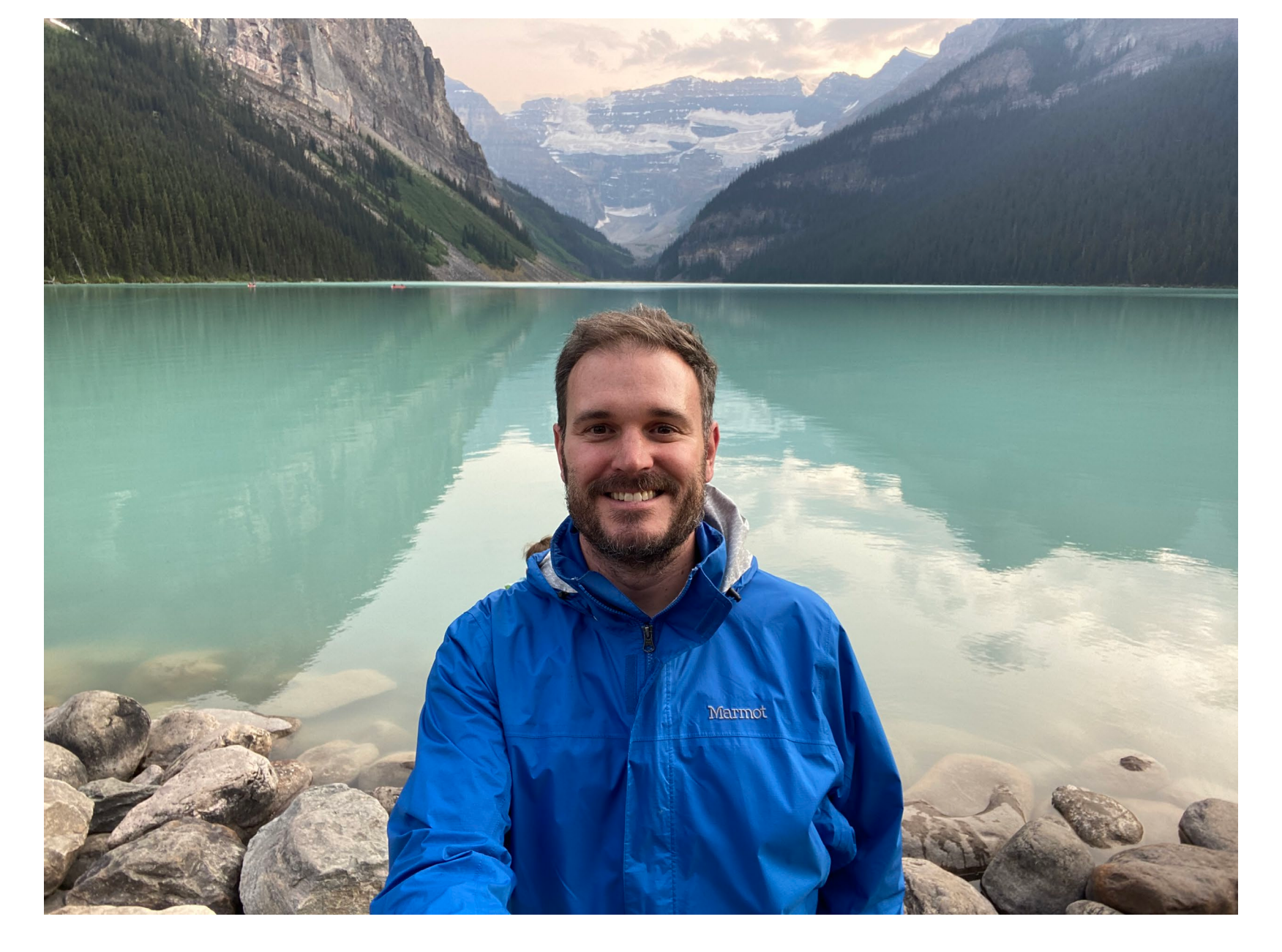
Lake Louise, Alberta