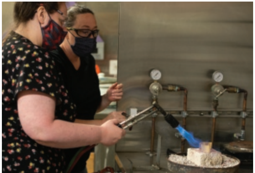
PERSONAL DEVELOPMENT: PAGES 7-19