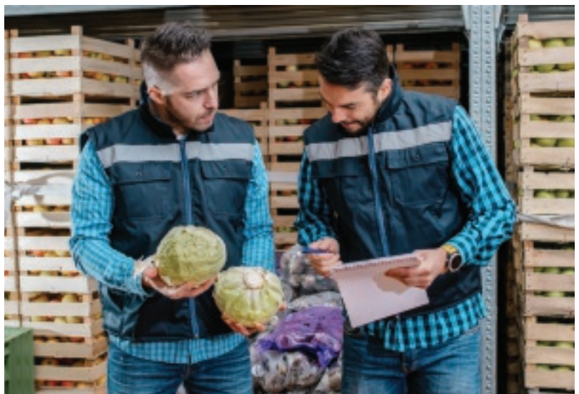
PROFESSIONAL DEVELOPMENT: PAGES 20-29