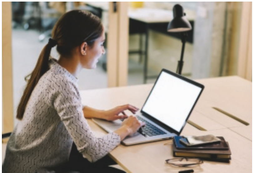
ONLINE BACHELOR'S DEGREE COMPLETION: PAGE 6

Director of Online Services and Educational Outreach