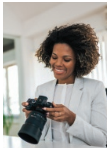
PHOTOGRAPHY COURSES: PAGE 12