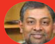
SIUE Alumni Association