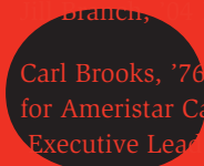
Class and Faculty Notes