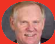
A Message from the Chancellor