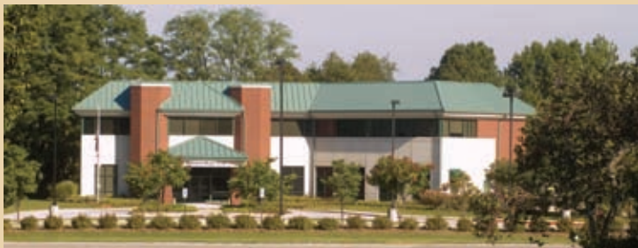
B. Barnard Birger Hall

The Heritage Society honors alumni and friends who include SIUE in their estate plans. These gifts for the future support scholarships, endowments, facilities, programs, and schools of the University.