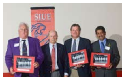
1979 Men's Tennis

Established in 2005, the SIUE Athletics Hall of Fame honors top student-athletes, teams, coaches, administrators, and friends of the program who have contributed significantly to the SIUE athletics program.