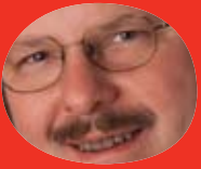
SIUE Alumni Association