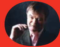
Theater and Travel