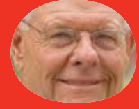
Alumni Donor Interview