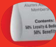
Alumni Membership Inside Back Cover