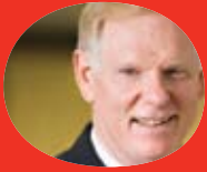
A Message from the Chancellor