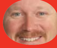
Scholarships and Awards