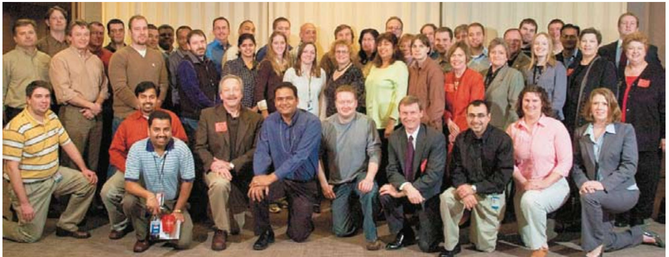
SIUE School of Business hosted a lunch for alumni at AT&T in downtown St. Louis February 25, 2008.