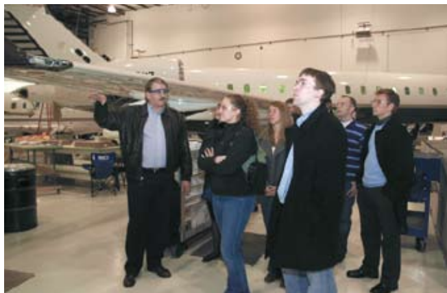
SIUE Students touring Midcoast Aviation