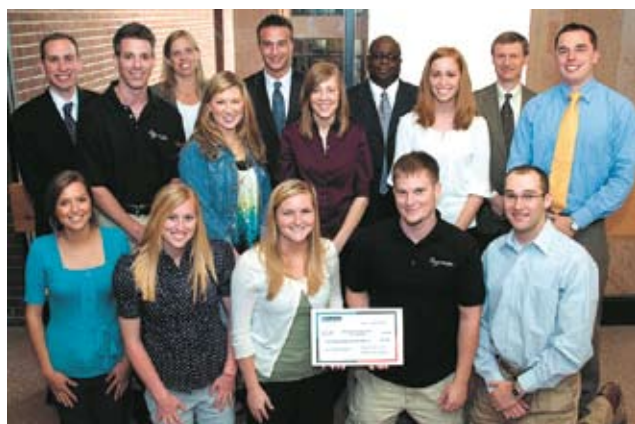
SIUE American Marketing Association Student Organization receives First Place Enterprise Award

Enterprise Rent-A-Car Foundation recently concluded its 2007-2008 incentive program for SIUE School of Business students. The program, in its second year at the School, recognizes dedicated, hardworking students who are active in one of the School's 15 student organizations and who go above and beyond their daily college responsibilities. It also provides these students with exposure to Enterprise Rent-A-Car executives, creating excellent recruitment opportunities.