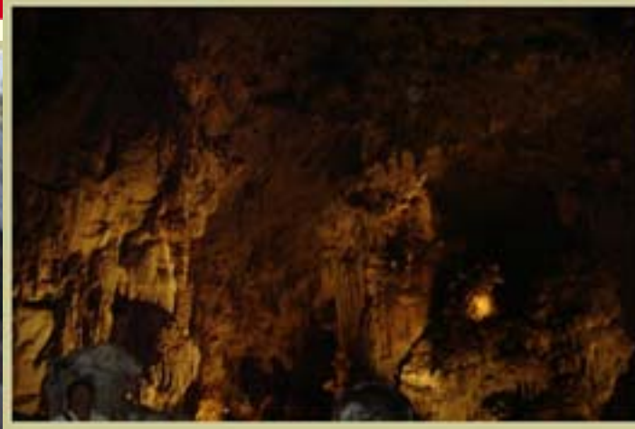
Grutas de Cacahuamilpa