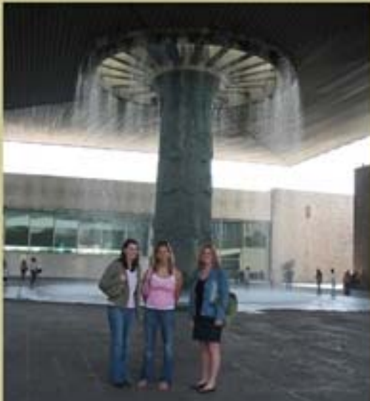
National Museum of Anthropology