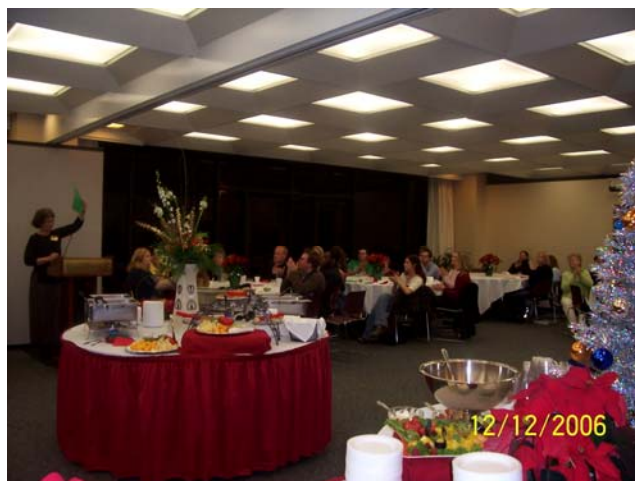
Holiday Gathering, December 2006