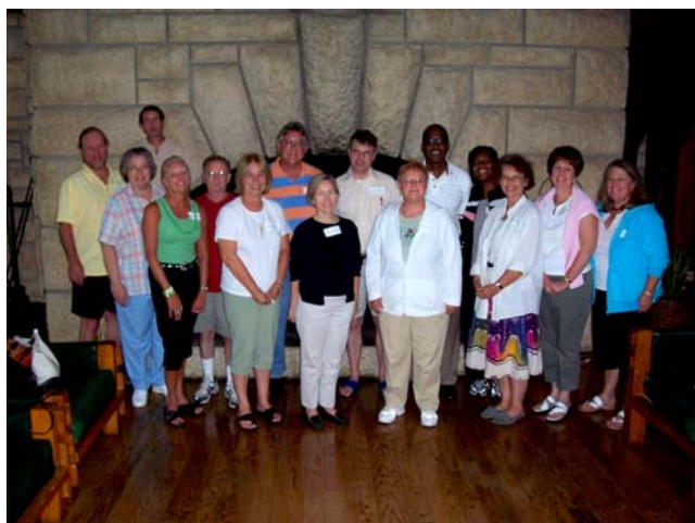
Faculty Retreat at Pere Marquette Lodge, August 2006