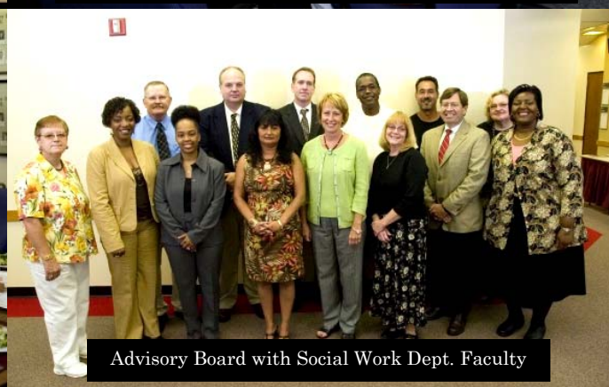
Advisory Board with Social Work Dept. Faculty