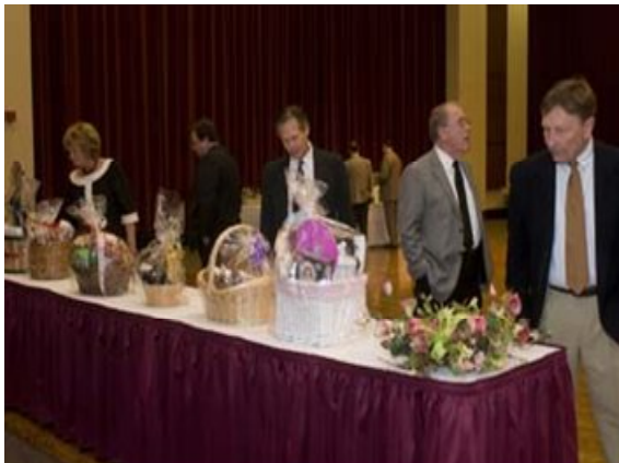
Apparently, male guests at the Gala preferred to browse the beautiful silent auction items ...