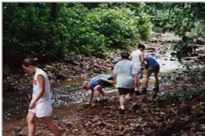
SIUE students explore the Rain Forest in Costa Rica.

to help build a home for a community member. Through the service of building a home, the students become deeply engaged with the community, and the language and culture of borderland Mexico becomes much more present to them.