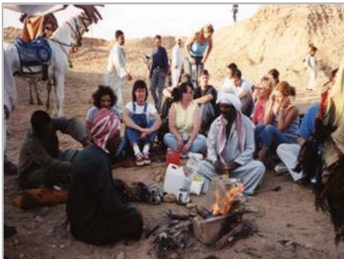
Students enjoy campfire tea with the Bedouins.