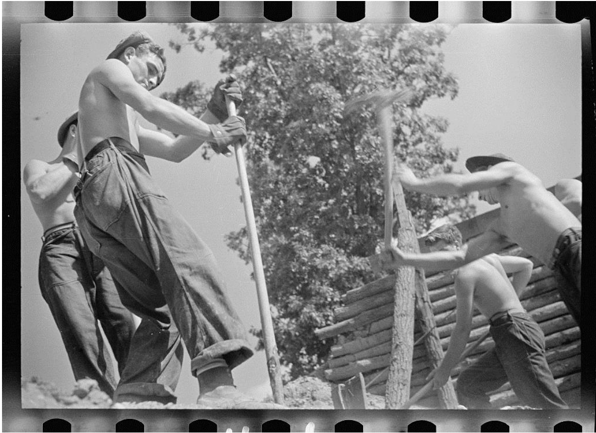
(1935) CCC Civilian Conservation Corps workers, Prince George's County, Maryland. Nov. [Image]