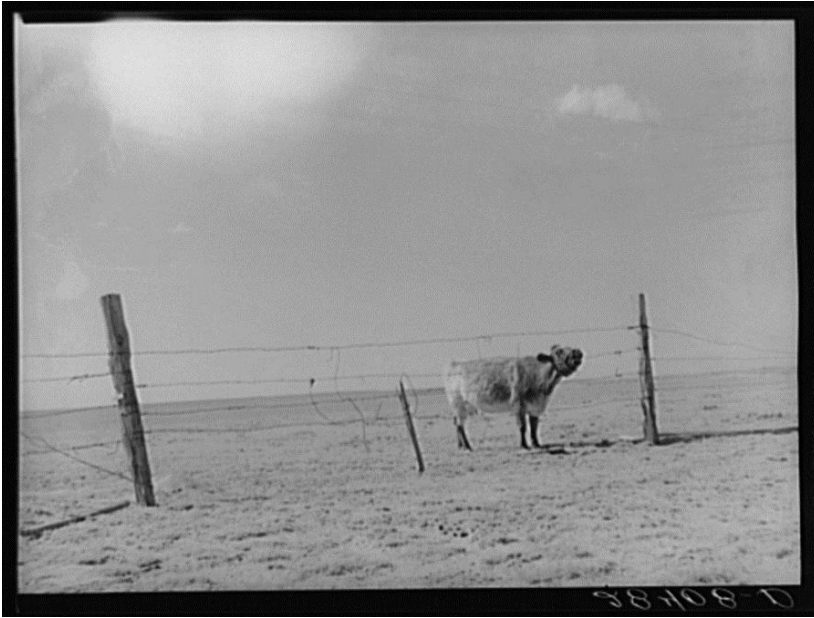
Arid land. Weld County, Colorado. Oct.

Excerpt: Out of the Dust Hesse, K. (1997). Out of the dust .