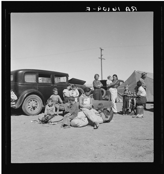
(1937) Four families, three of them related with fifteen children, from the Dust Bowl in Texas in an overnight roadside camp near Calipatria, California. Mar. [Image] Retrieved from the Library of Congress, https://www.loc.gov/item/fsa2000000789/PP/.

We'll be back when the rain comes, they say, pulling away with all they own, straining the springs of their motor cars. Don't forget us.