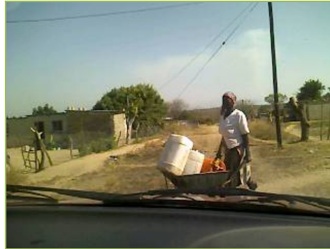
The photos show women pumping water from a government owned pump, then transporting the water several miles to their homes.