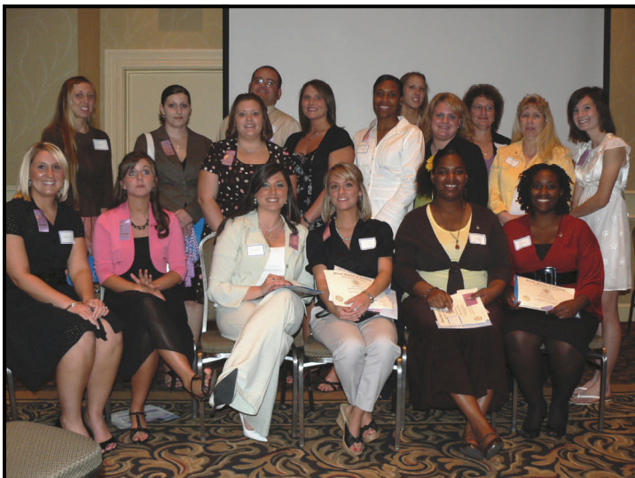
Undergraduate , Graduate and Community Leader Inductees

Vision 2020 Theme 4: Comprehensive leadership development programs are required to ensure that nurses have the skills to be global leaders in 2020 and beyond.