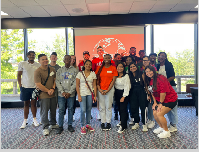
The inaguaral Fall 2023 ISMP cohort attends orientation