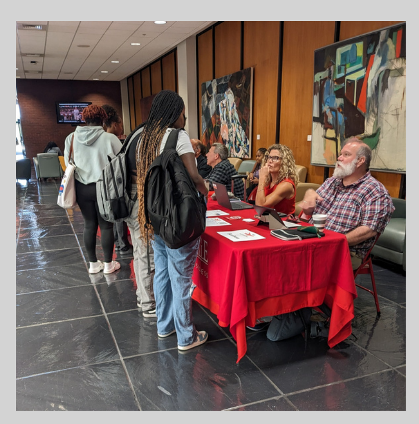
Students visit the School of Business table at the Fall 2023 Study Abroad Fair