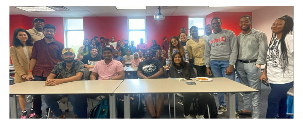
Workshops Getting Involved Health & Wellness The U.S. Classroom Culture Shock Employment Succeeding Socially

This series is composed of six workshops spanning 12 weeks, on topics such as navigating differences of the U.S. classroom and overcoming culture shock. Content has been developed by International Affairs and guest speakers from a variety of SIUE offices, such as Counseling Services, Academic Advancement, the Kimmel Student Involvement Center, and more. Many of the workshops also feature student panels, composed of current international students sharing their experiences and offering advice meant to help new international students adapt and thrive at SIUE.