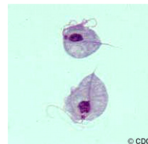
Two Trichomonas vaginalis parasites, magnified (seen under a microscope)

Pregnant women with trichomoniasis are more likely to have their babies too early (preterm delivery). Also, babies born to infected mothers are more likely to have an officially low birth weight (less than 5.5 pounds).