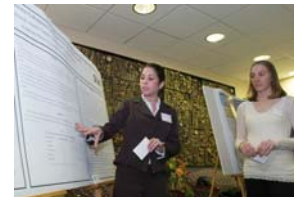
Student presenting research last year

a faculty mentor's research in which they are active, and a completed Information/Application sheet to the Graduate School by March 18th. These abstracts will be used for planning purposes and will be included in a booklet that will be available the day of the event. The Information/Application sheet is available at www.siu.edu/graduate .