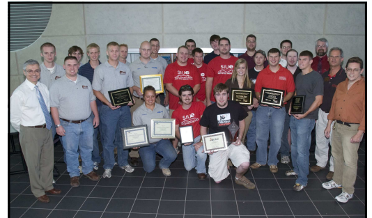
Congratulations to everyone on a job well done!

Each group had the opportunity to talk about their experience in the competition.