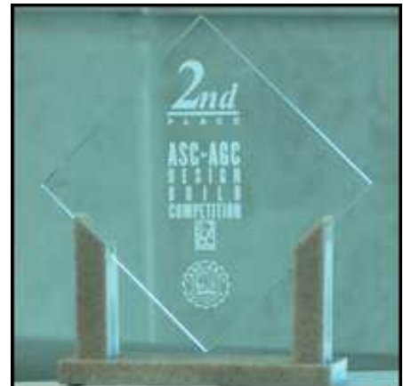
Pictured is the second place award earned by Trophy Construction in the recent Associated Schools of Construction Great Lakes Region Design/Build Competition.

The team wishes to thank everyone who helped the team prepare for the competition, including the construction faculty, Tarlton Corporation, Korte Construction, McCarthy Building Companies, Kozeny-Wagner, and the Construction Alumni, who pay for student registration and traveling expenses with an annual golf tournament.