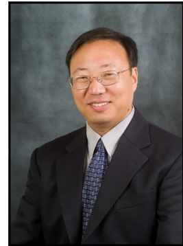
Luo is an internationally recognized expert in nonlinear dynamics and vibration.

Luo has been doing research and study of the theory and application of nonlinear dynamics and mechanics for more than 20 years. He recently developed the theory of flow global transversality in nonlinear dynamic systems. Luo's research in vibration helps manufacturers discover ways to make production more efficient and thus more profitable.