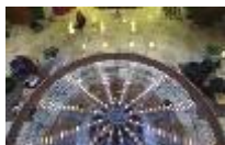
A shopper walks out of JC Penney near the