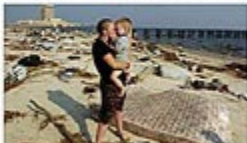
Hurricane Katrina LEAST POWER THAT CHANGED THE MISSISSIPPI COAST FOREVER

The Story of Hurricane Katrina as only the Sun Herald can tell it.