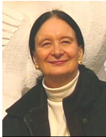
Professor Susan Haack, Distinguished Professor in the Humanities, Cooper Senior Scholar in Arts and Sciences, Professor of Philosophy, and Professor of Law at the University of Miami .