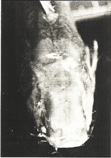
Frontal view of one of the cave specimens of Rhamdia quelen captured in 2001. It has eyes and pigmentation, just like any other individual of the river populations.

cave in Mexico where light penetrates: the lighted area is occupied by eyed Mexican tetra which are very aggressive toward its blind congener when the latter tries to go into the illuminated portion of the cave. Since the