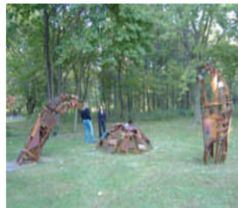
Honorable Mention: "Reexistence of Permanence"