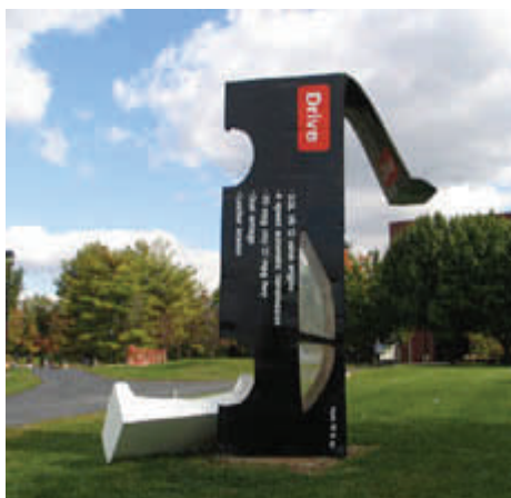
Best Sculpture: "Drive" Sarah Frost