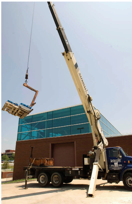
Loading Green Roof Blocks and research materials required a cherry-picker to hoist pallets to the roof of the Engineering Building.

Similar projects are taking place across the United States including Penn State University, Michigan State University, the University of Central Florida, North Carolina State University, University of Georgia, and the University of Missouri-Columbia.