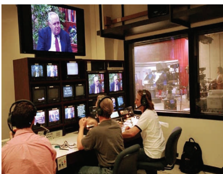
Mass Communications students (shown above) train in the state-of-the-art digital studio at SIUE.

One of the best indicators of a quality academic program is accreditation or certification from an independent organization. All CAS programs that have accrediting organizations have either earned accreditation or are in the process of preparing for an accreditation review over the course of this five-year strategic plan period.