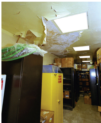
Photo above shows the major repairs that are needed due to water leaks in the antiquated heating and cooling systems. Valuable research data has been lost due to "floods" inside the Science Building.

In December of 2003, Governor Rod Blagojevich announced at a press conference at the Lewis and Clark Community College that he was including the SIUE Science Building as a priority for the Governor's Opportunity Returns plan for Southwestern Illinois. At that time,