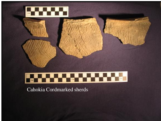
Cahokia Cordmarked sherds