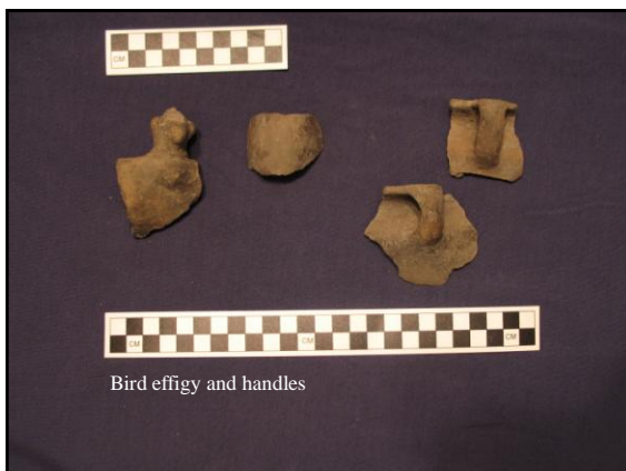
Bird effigy and handles