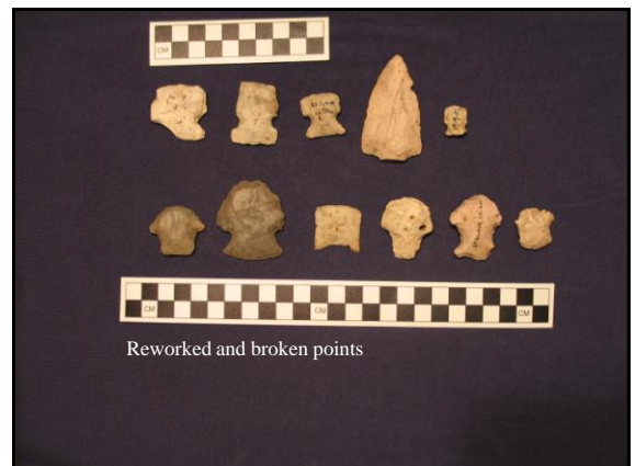
Reworked and broken points