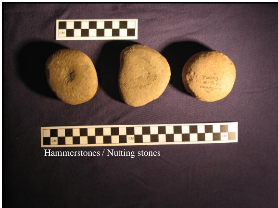
Hammerstones / Nutting stones