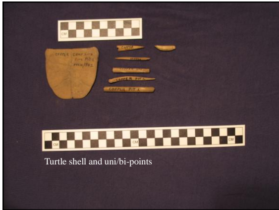
Turtle shell and uni/bi-points