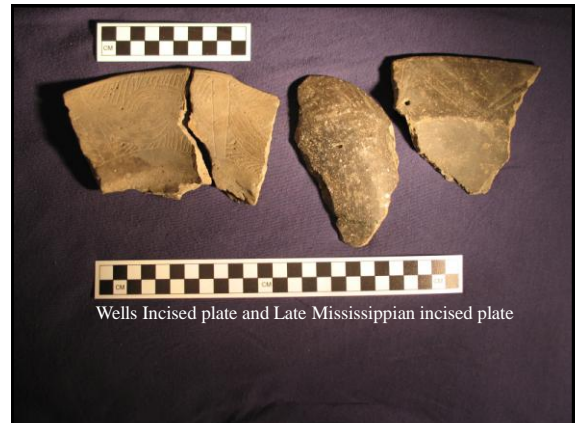
Wells Incised plate and Late Mississippian incised plate