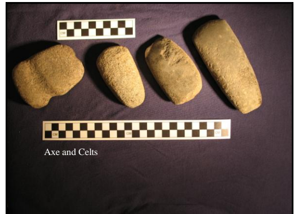
Axe and Celts