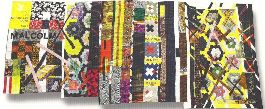
SUN SMITH-FORET: Art About Film